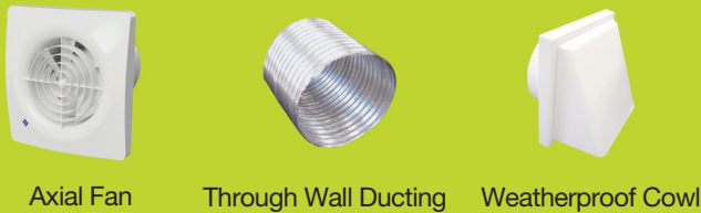
Axial Fan Through Wall Ducting Weatherproof Cowl