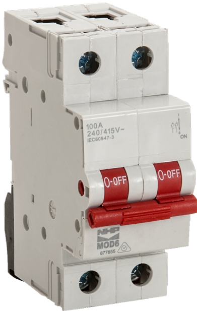
MOD6 main switch, DIN rail, 2P, 100A

Representative Photo Only (actual product may vary based on configuration selections)